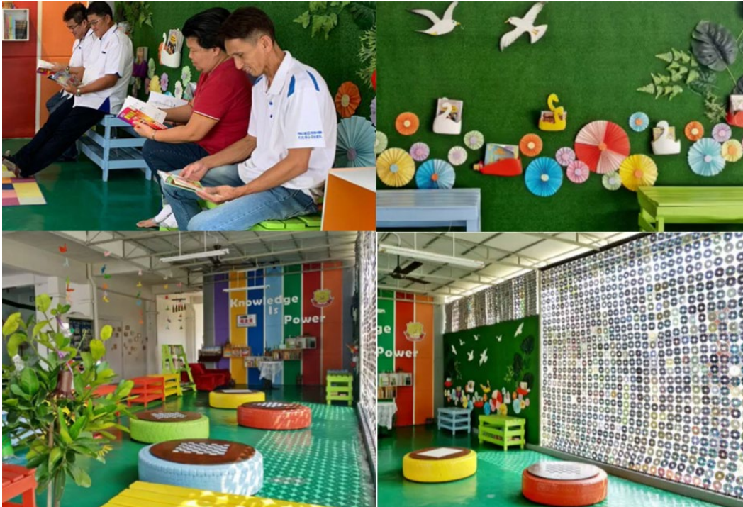
3 Nov 2019, SJK(C) Woon Hwa, Bandar Baru Kangkar Pulai, Kangkar Pulai, Johor

Century Bond Bhd (“CBB”), therefore, hope that by adding a ‘Reading Corner’ in school will encourage more students to read books. In addition to the ability in regulating reading materials provided to the students, the school will not only improve the standard of reading through the Reading Corner, but it will also enhance the standard of knowledge in various fields possessed by the student.