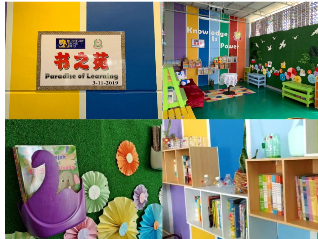
3 Nov 2019, SJK(C ) Woon Hwa, Bandar Baru Kangkar Pulai, Kangkar Pulai, Johor

On the contrary, the tradition of reading books has avoided such negative challenge posed by the high-tech products.